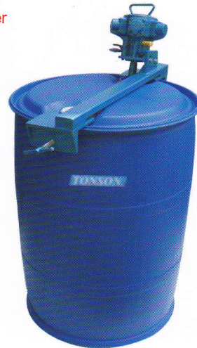
TS-CT Cross Tank Mount +Angle Bung Entry Air Mixer