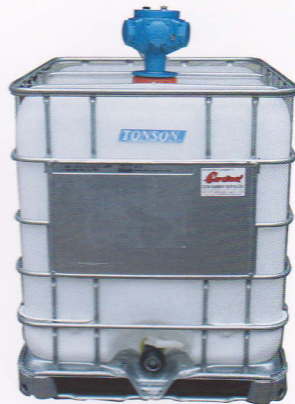
IBC Tank For Industry Angle Bung Entry Air Mixer