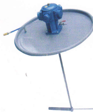
TS-MI Stand Mixer Optional Contamination Shield