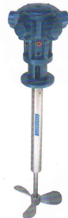
TS-SS Specificial Mixer (white iron shaft and 11" white iron propeller are additional, accessories be customized.)