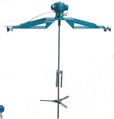
IBC Tank Mixer