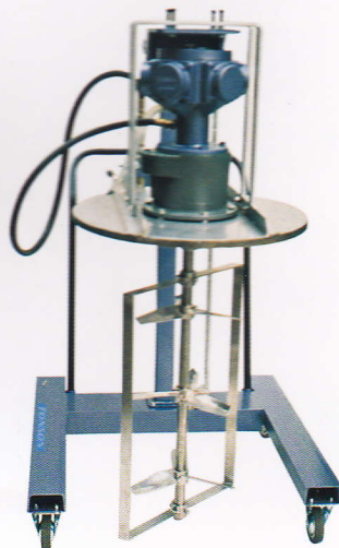
Specificial Trolley Mount Air Mixer (High Viscosity)