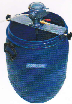
TS-SS Cross Tank Mount Air Mixer Specialized In Small Tank

Without reflux device, discharge speed and volume may be easily adjusted. precipitated material may be well mixed and pumped.