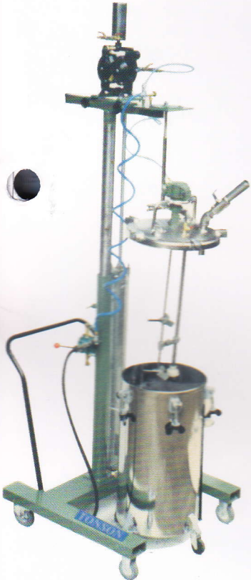
TU-CP Mobile air lift mixer with stainless steel lid and pump

Without reflux device, discharge speed and volume may be easily adjusted. precipitated material may be well mixed and pumped.