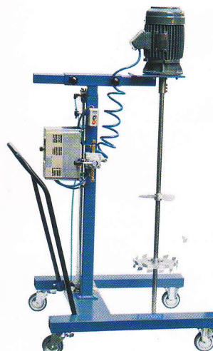
Trolley Mount Electric Mixer