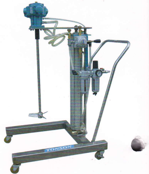
STU Mobile Air Lift Mixer STU-SUS • All cylinder operation • Equipped with 4 sturdy casters (2 fixed and 2 swivel) for easy movability.

Put tank into the mixer, then can operate with stepless control