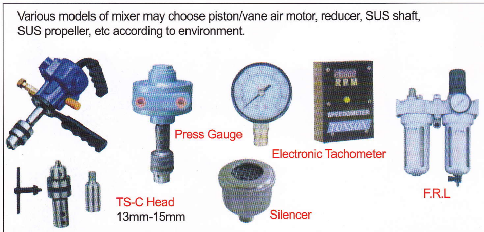
TS-C Head 13mm-15mm