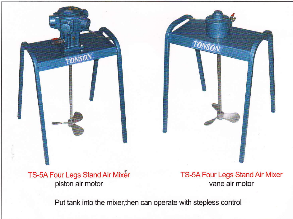
TS-5A Four Legs Stand Air Mixer piston air motor