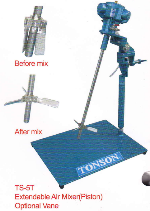
TS-5T Extendable Air Mixer(Piston) Optional Vane