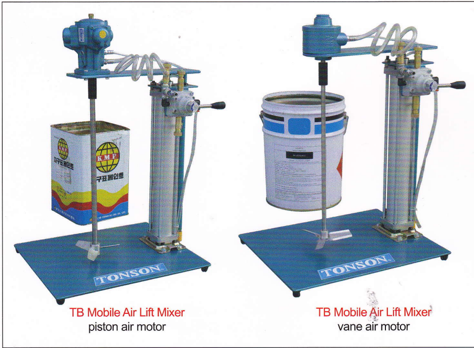
TB Mobile Air Lift Mixer piston air motor