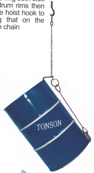
F10 MULTI-FUNCTION DRUM LIFTERS Max.load:300kg

Oblique lifting : hook the ring both side of the drum rims then hang the hoist hook to the ring that on the movable chain