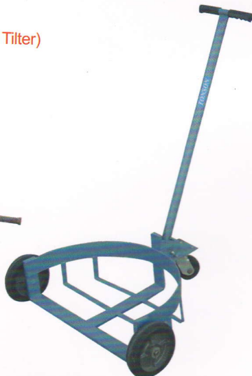
F-12 Save Labour Drum Truck