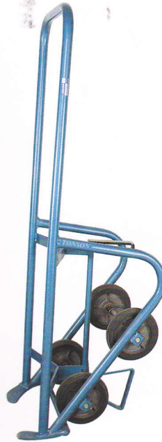
F28 Multi-Function Carrier