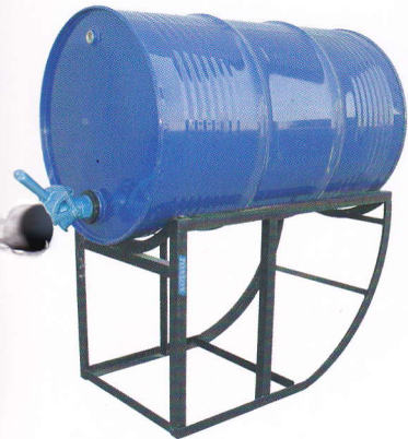
T-FV Easy Lifting Frame (Two-man Tilter)