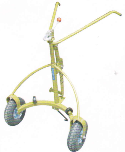
F11 Multi-Function Truck