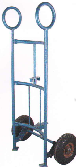
U2 Drum Truck