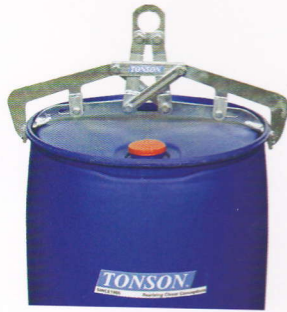
DL-1 Drum Lifting