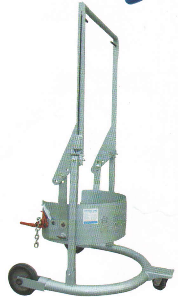
F16 Magic Carrier