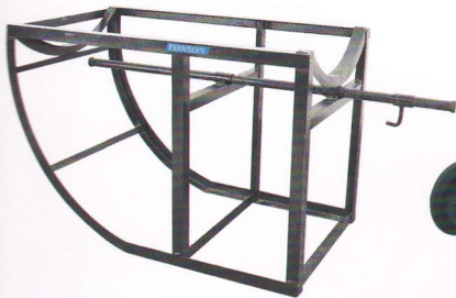
T-FV-1 Easy Lifting Frame (One-man Tilter)